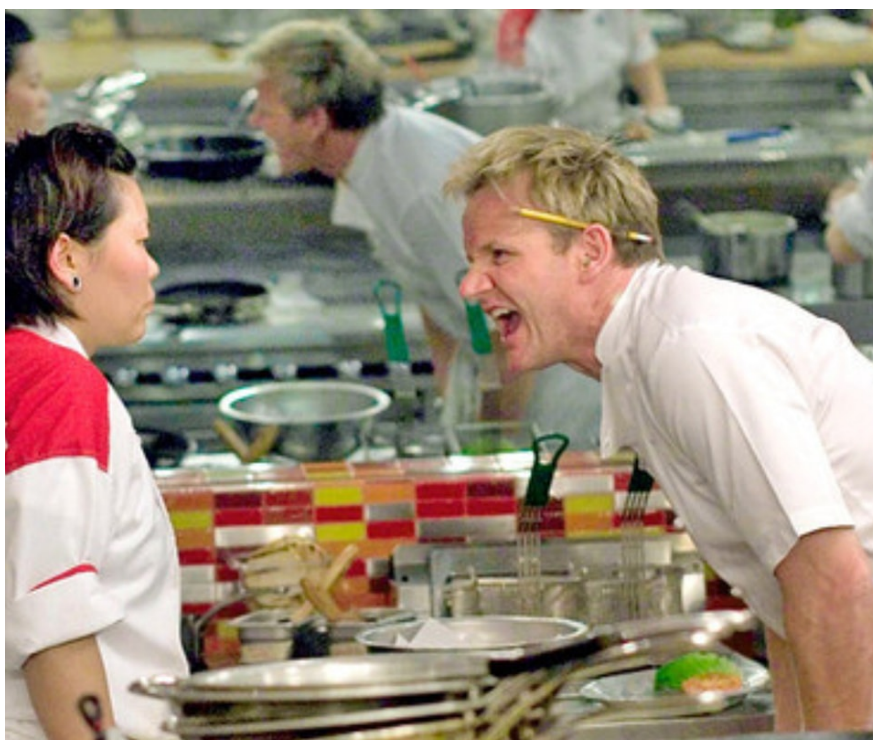
Action shot of the "Make Your Own Pizza" Teambuilding Event for Staff At Govenor Livingston!